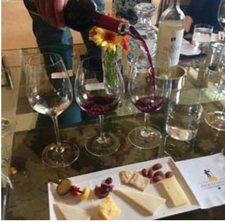
Winetasting at Silver Trident

Finally, no visit to Yountville is complete without a visit to Pancha's -Napa's favorite dive bar and a Yountville institution favored by everyone from politicians, to golf pros, to the local labor force who gather for late night pool and '70s jukebox tunes. A sign on the wall reads, "Welcome to Pancha's, where the customer is always wrong." Don't worry; that gruffness is part of its